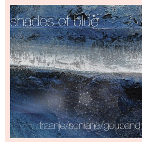
Shades of Blue