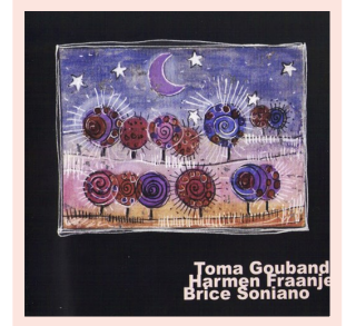
Par 4 Chemins